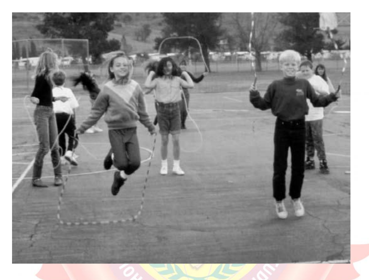
Fig.1.1 Students performing physical activities in school

Physical activity is defined as any form of exercise or movement and may include planned activity such as walking, running or other sports. It may also include daily activities such as household chores, gardening and walking the dog.